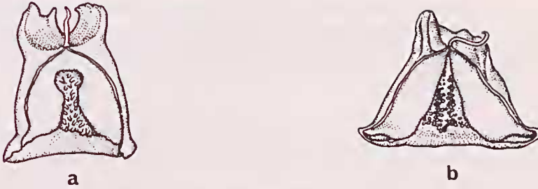
Fig. 2. Characteristic shapes of the incomplete septum of the inner articulating faces of the operculum valves in Zaleyia galericulata (X10). a, ssp. galericulata (S. Jacobs 3040). b, ssp. australis (Cunningham 1703 & Milthorpe).

galericulata this gap is narrowest in the lower half of the operculum valves and extends to within about 0.5 mm of the top of the operculum. Apart from this distinction, T. australis mostly has 5 stamens (one specimen at the geographical boundary between the two taxa has 10 stamens), a dome-shaped operculum, and is found mostly on the Western Slopes and Plains of New South Wales, with one specimen from N. Queensland. T. galericulata has 5 or 10 stamens (about half the specimens with each number), the operculum apex is frequently crowned (though this is not developed in many specimens), and is found in the North Far Western Plains (NFWP) of New South Wales and throughout the rest of the mainland States except Victoria, with one specimen from the Central Western Slopes of New South Wales (probably introduced). Both taxa occur in the NFWP of New South Wales, T. australis in the SE. of the region and T. galericulata in the NW.